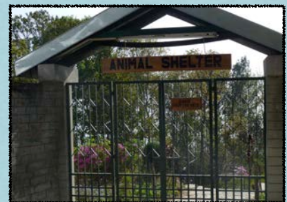
ENTRANCE GATE TO KALIMPONG ANIMAL SHELTER. THE POT-HOLED ROAD ALONG THE RIDGE ENDS AT THIS POINT.