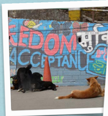
After vaccination and spaying they live in a symbiotic relationship with the human inhabitants of Darjeeling and Kalimpong

* The street dogs will always be around so long as there is garbage and so long as there are people to feed them.