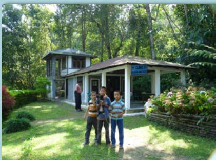
THE DISPENSARY AT KALIMPONG ANIMAL SHELTER WITH GUEST ROOM FOR VOLUNTEERS BEHIND

which leads to a second gate, inside which lots of dogs wait to greet visitors. I wish you could see the shelter – the clinic, kitchen, operating theatre, kennels, dog runs, cattery, two volunteer huts, and vet's house are all attractive, local-style, white-washed free-standing huts or buildings set in two acres of garden. I do believe the gardens help in the rapid healing of animals.