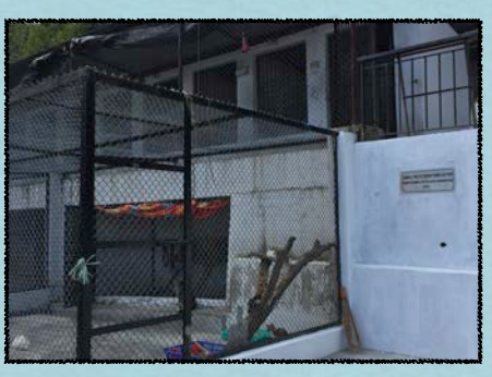
Fortunately APN (Sweden) has donated a cattery to both DAS and KAS.