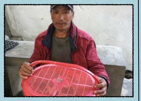
A man brought his mother cat for spaying at Darjeeling Animal Shelter and also surrendered three kittens.