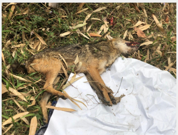
DECEASED JACKAL.