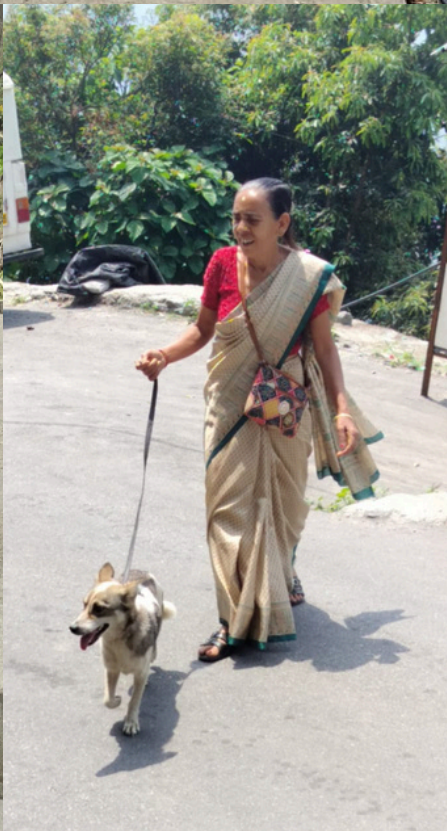
A NEW STANDEE FOR CAMPS