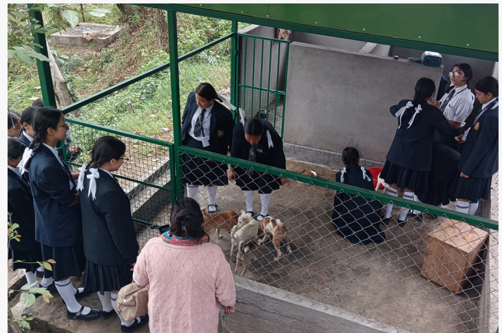
Students petting puppies at Kalimpong Animal Shleter