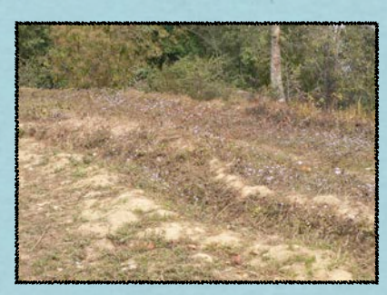
BARE LAND: It seemed as though the kennels and gardens would take years to be established, but within a couple of years the shelter was functioning.