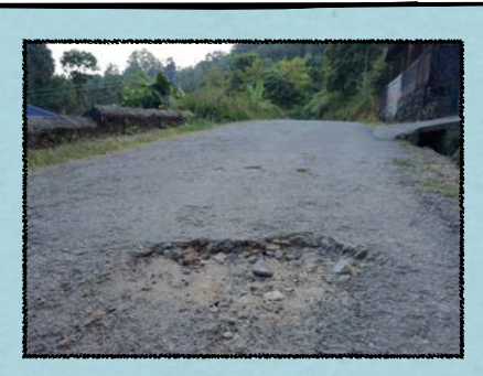
COST OF VEHICLE REPAIRS The pot-holed roads, a result of heavy rain, can take a heavy toll on vehicle brakes, tyres and engines.