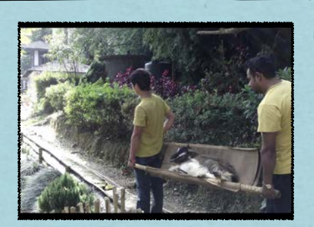
MANY MEANS OF TRANSPORT Locals have become adept at adapting to the difficult road conditions and may use stretchers or head baskets to carry animals in need of treatemne to KAS