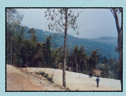
When DGAS trust purchased the land from Mr. Donald Karthak, there were terraces of paddy fields. Architect Ashok Pradhan arranged for the levelling and extension of some of the steppes.

Altogether 268 animals were rescued, 199 surrendered, and 95 admitted for treatment. Some shelter animals were also treated amounting to a total of 593 veterinary treatments carried out.