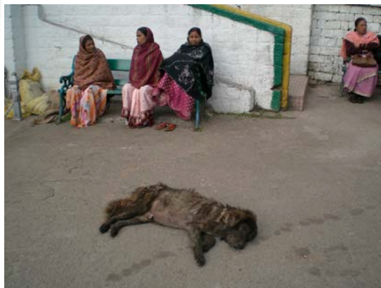
A street dog rests peacefully unperturbed

KAS, whose ABC programme started in 1998, has in total spayed, vaccinated against rabies, and released, either to owners or back onto the street, 6319 dogs. Last year, despite the difficulties of distance and shy dogs, KAS sterilised (between April 2012 and March 2013), 576 dogs, meaning thousands of puppies and dogs were saved from poisoning, and now lead more secure lives.