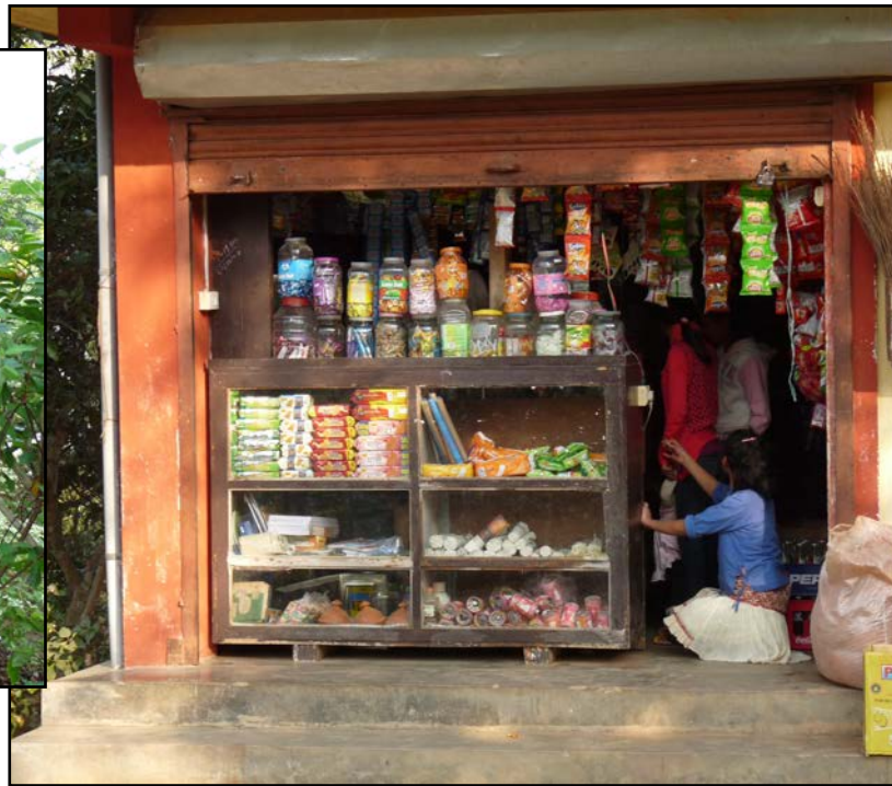
ABOVE AND RIGHT: The local village of Barbot Bazaar is the closest hamlet to KAS. 'Barbot' is the Lepcha word for the sacred Peepal tree.