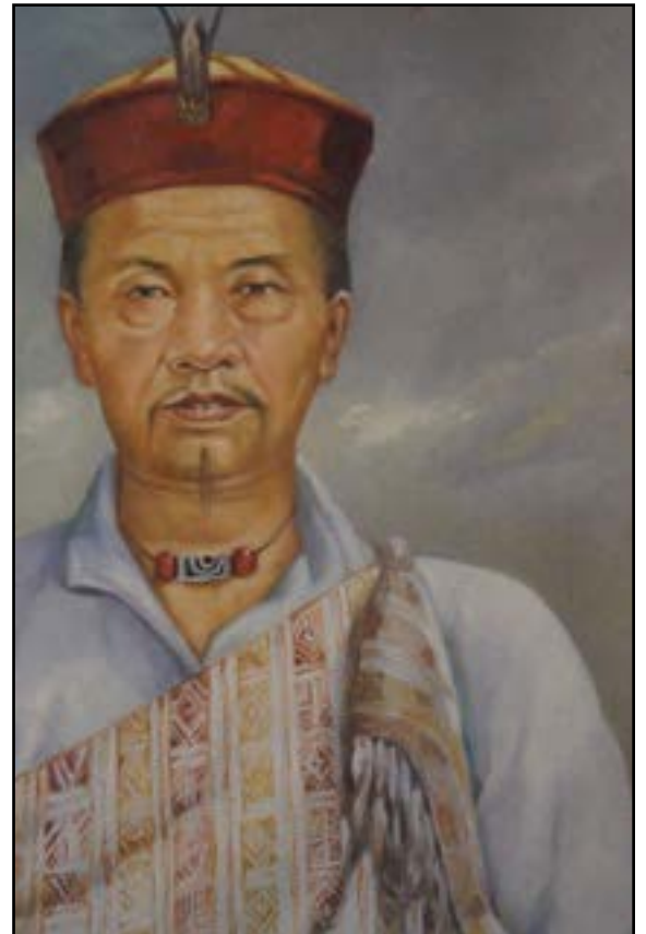
The last Lepcha King, Gyabo Achuk. The Lepchas had a sophisticated civilisation. Their beautiful wooden houses were constructed without using a single nail. It is feared their language will be lost but the Central Government is funding various projects to help conserve the Lepcha culture.