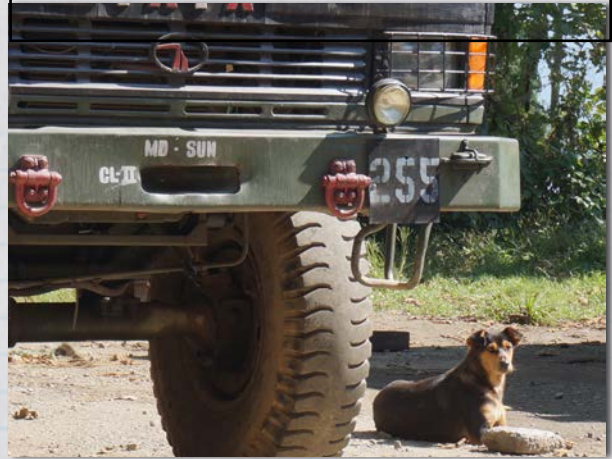
A cautious dog hides under an army vehicle