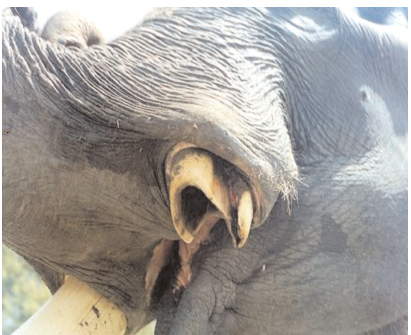
Figure 5: Pustules on the tongue of an elephant