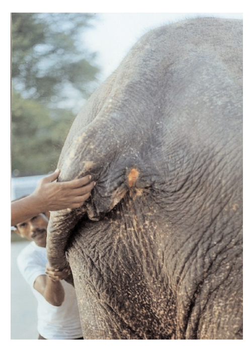
Figure 3: Lacerated wound on tail base