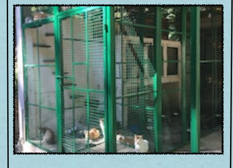
Cats rest in the sun in the current cattery but it is too small for the number of cats now held at KAS.