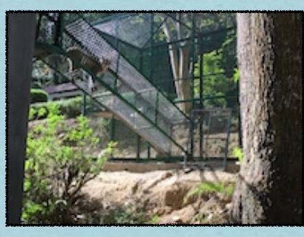
Between the two cat cages there is a ramp which the cats like to use. The number of cats rescued by KAS increases daily.