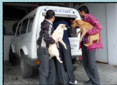
Back at the shelter the street dogs are unloaded from the vehicle in the garage (the gate of which is locked to prevent escape)