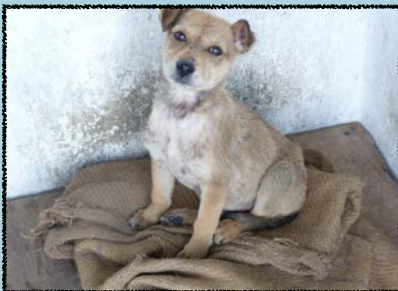
A DAS ABC DOG RECOVERING AND AWAITING RELEASE BACK INTO THE SAME PLACE SHE WAS CAUGHT