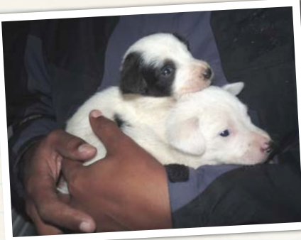
A Good Year for Rescues