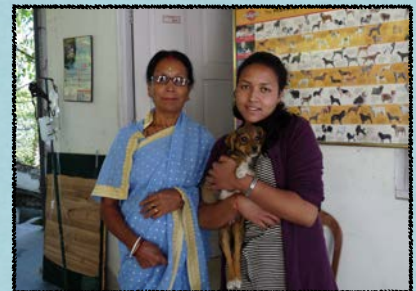
TWO WOMEN BRING THEIR PUP FOR TREATMENT AT DAS