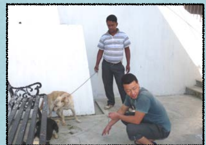
The dogs are led up to the ABC kennels on leads. They are given time to sniff their surroundings and settle down.