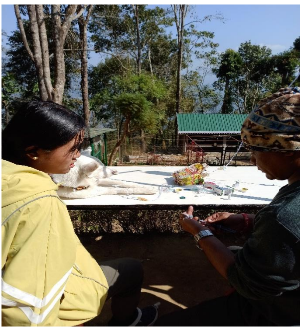
ANIMAL CLINIC AT KAS