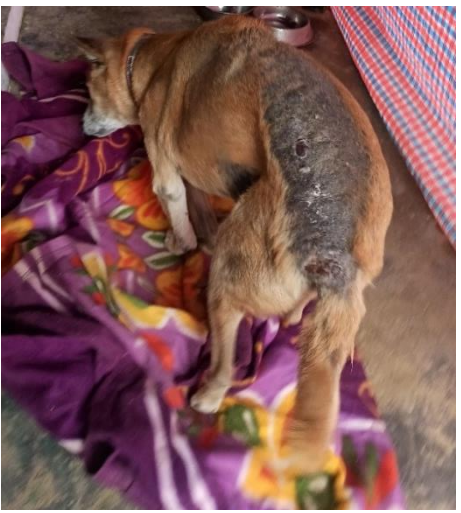
This poor boy was rescued a week ago who is now admitted to KAS. Currently, he is on treatment against mange.