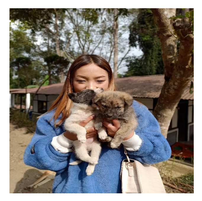
Happiness is going home and to a loved one.

These adopters were glad to have them in their arms and commit to taking care of them for a lifetime.