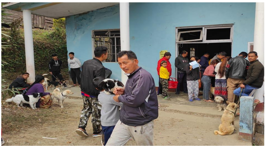
Owners queuing up at camp for getting their pet animals sterilised and vaccinated