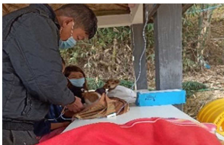
Animal Clinic in Covid times