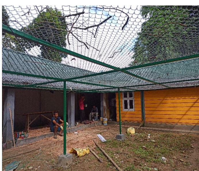
New Cattery – Work in progress