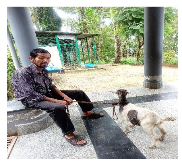
Sick kittens and a goat for treatment at KAS