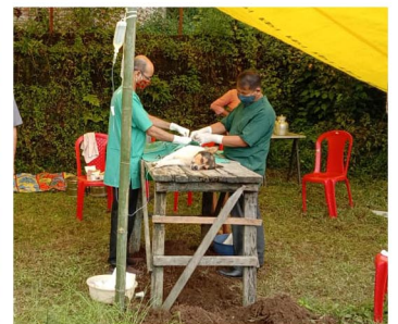
A typical village makeshift spay and neuter camp.