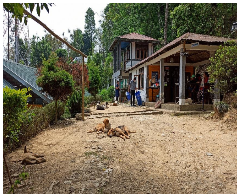
The KAS Clinic