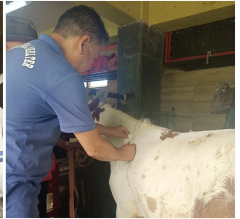
Wangel from DAS vaccinating a Pony from Darjeeling, Chowrasta