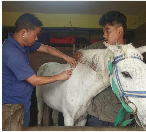
Yearly vaccination of Ponies by DAS