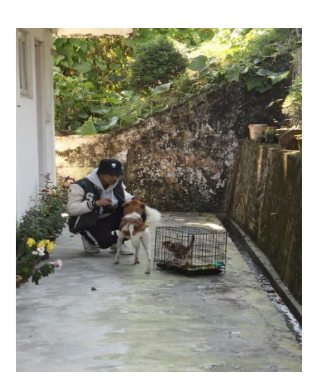
Clinical treatment of animals at DAS

As October marked the month for the Diwali celebration in India, there were a few holidays and so much spirit of enjoyment all over. But the Shelter remained open throughout and helped ample animals.