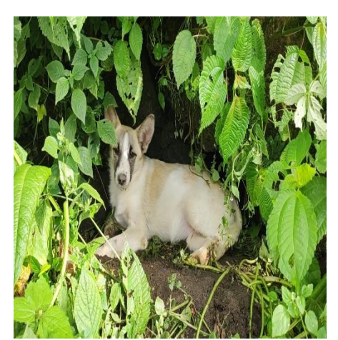
Rescue dogs found in faraway lanes of Chowrasta