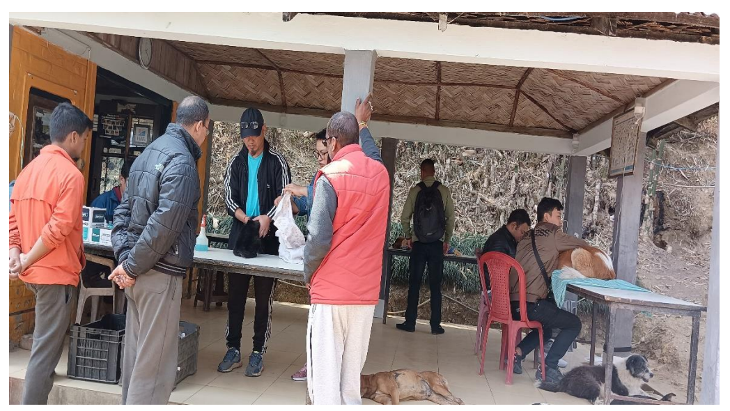
Treatment of dogs at the KAS Clinic

The clinical cases are increasing at Kalimpong Animal Shelter because of the viral illness. Sick dogs are coming for treatment at the KAS clinic and following the treatment course of seven days. This is keeping the team busy, the ones in charge of the Clinic Department.