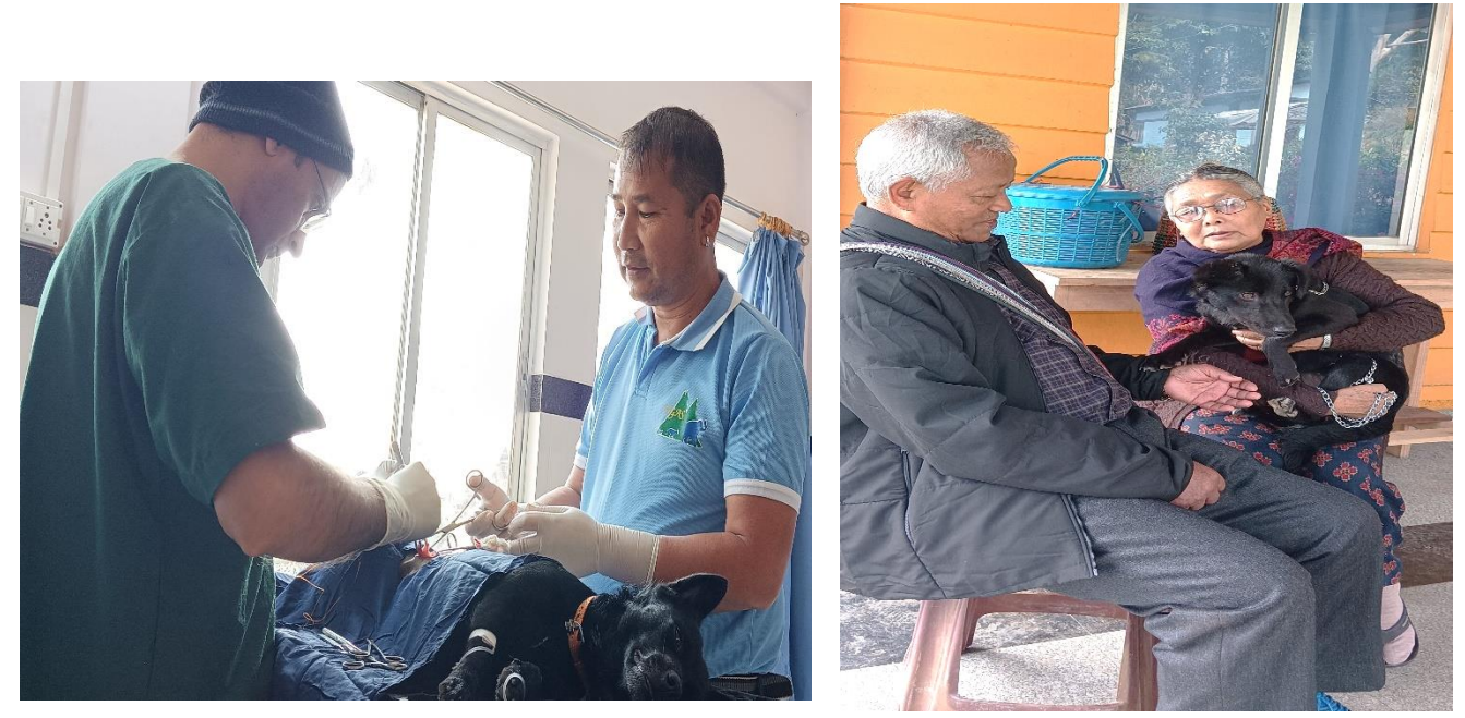
An elderly couple wait for spaying their dog at KAS

Lots of puppies have come as rescues to the Shelter and we have been searching for a loving home for them. A few of them have already been adopted.