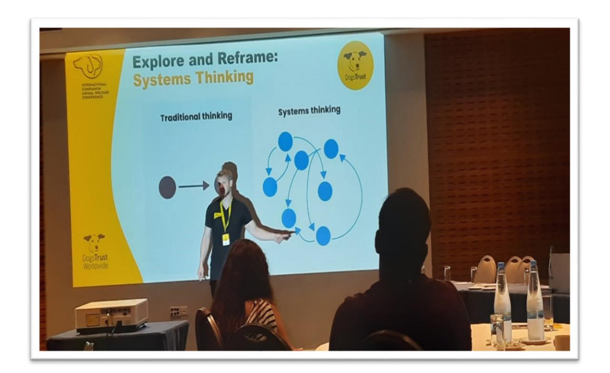
The Conference at Nicosia