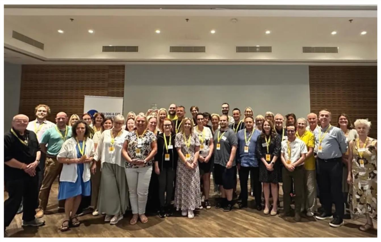
With the representatives from various Animal Organisations