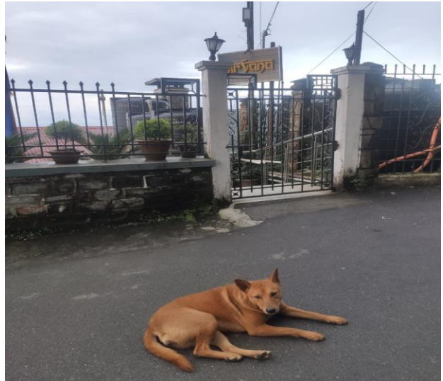
Treatment and rescue

The team has rescued a few puppies and kittens out of which seven have already found their forever home. The remaining ones too are waiting for their luck to be adopted. All these litters are dewormed and vaccinated when they are accommodated in the Shelter.