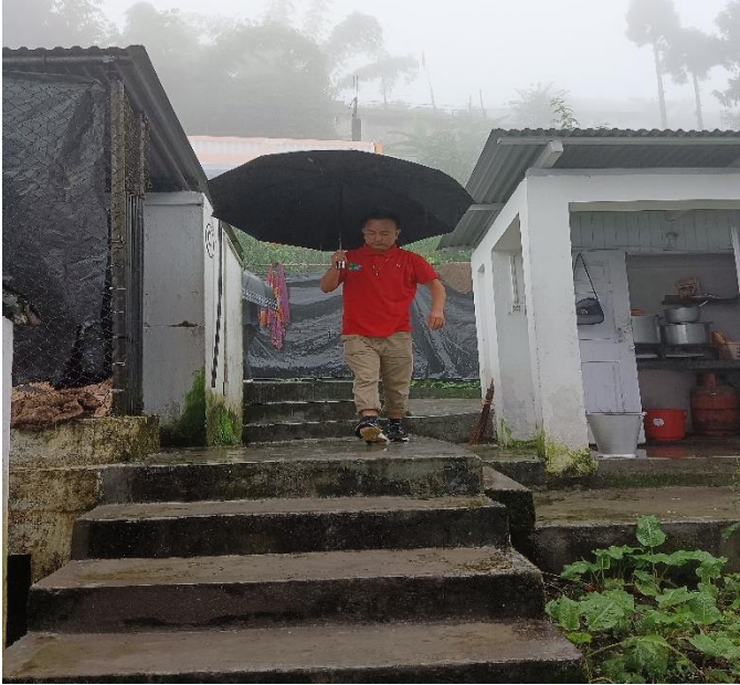
DAS in the monsoon rain this August

In Pic – the way to the kennels and shed