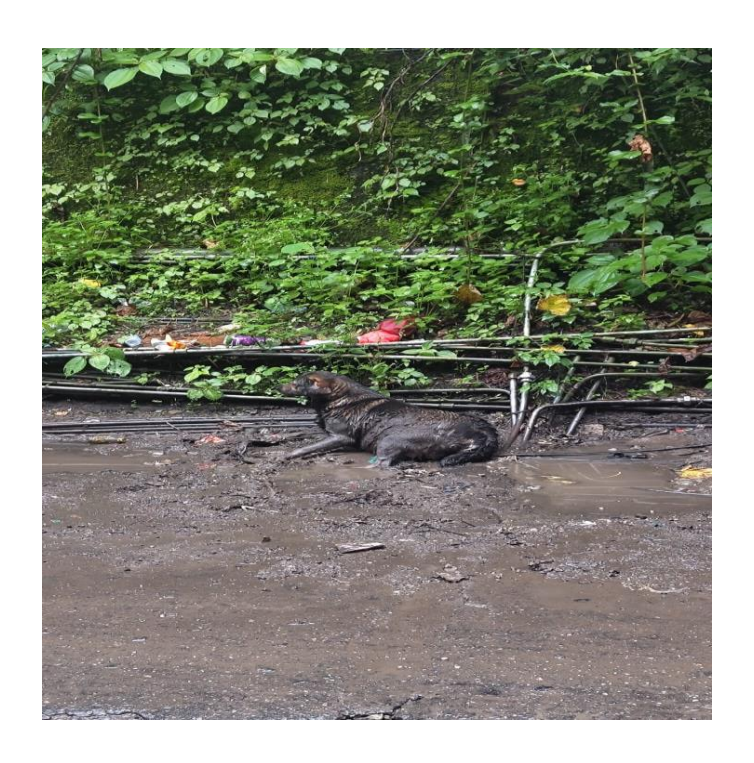
A photo of the sick dog stuck in filth. The DAS team went to his immediate rescue \,