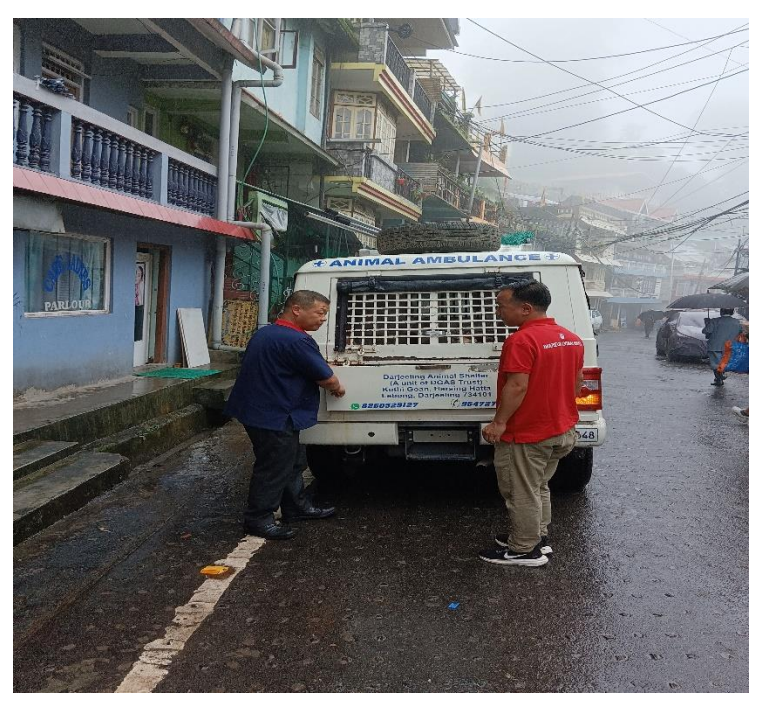
In Pic - The team is ready to release spayed dogs back into their territory