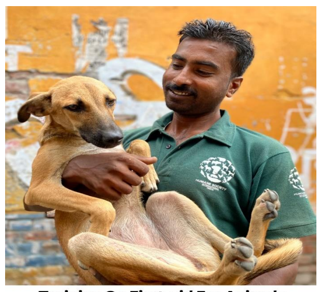
Training On First-aid For Animals

On the 23rd of August, Darjeeling Animal Shelter in collaboration with Humane Society International and the Animal Resource Department (ARD) conducted an educational Training Programme on First aid for animal lovers, advocates, and working members associated with animals.