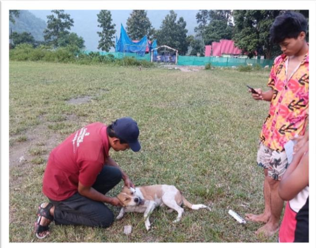
The Shelter team vaccinates dogs in the flood-affected area

The rescued puppies from the flash-flood-affected Teesta are thriving and growing rapidly. One of the four puppies has already found a loving family in Kalimpong, and we remain hopeful that the others will soon find forever homes as well.