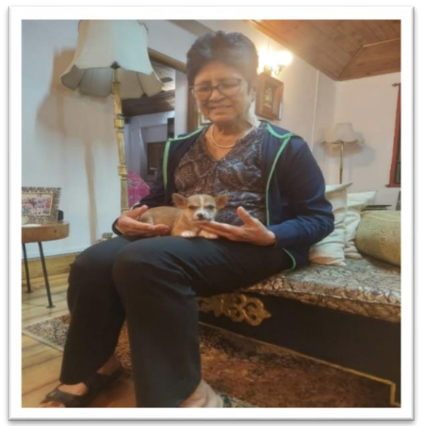
The rescued mamma dog and her babies from Teesta out of which one has found a loving home (as shown in pic 2)