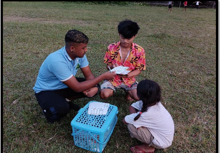
Vaccination certificate is handed out to an owner