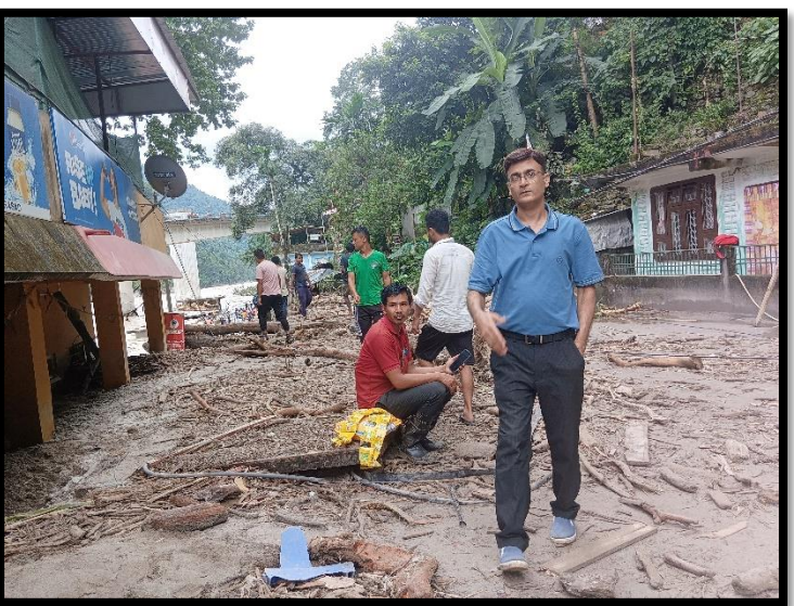
The settlement at Teesta was ravaged by flash floods