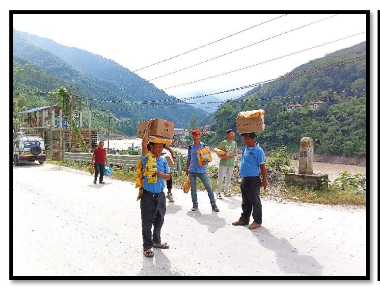
The KAS team carrying kibble for dogs at Bhalukhola