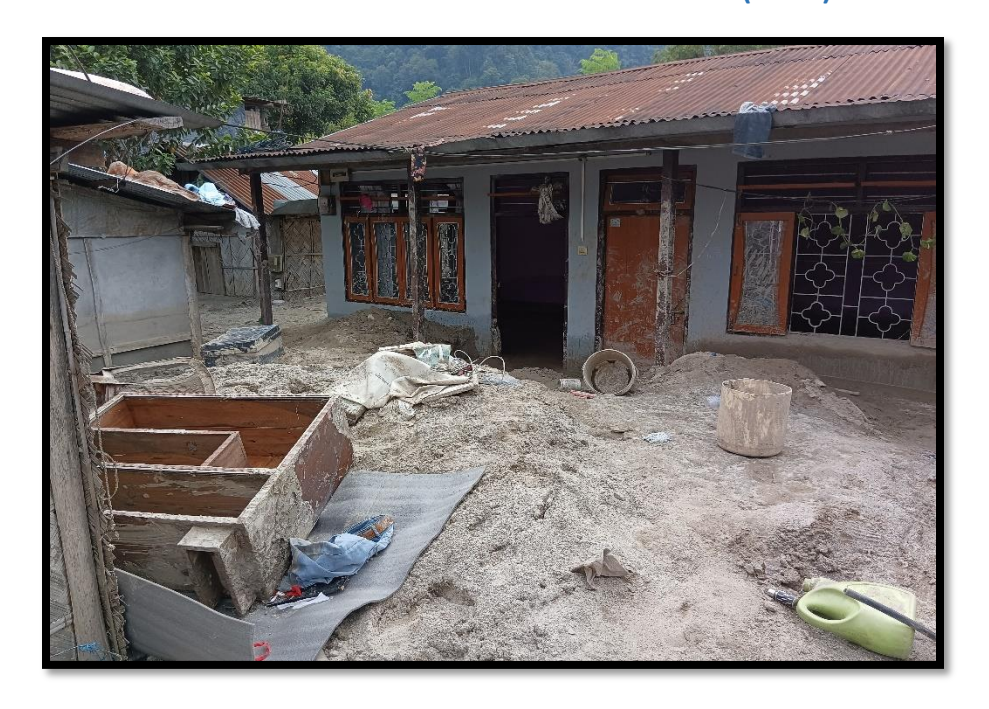
In Pic – A house at Rongpo that caved in and submerged in debris

Relief for animals in the wake of the Glacial Lake Outburst flood (GLOF) in Sikkim and Teesta