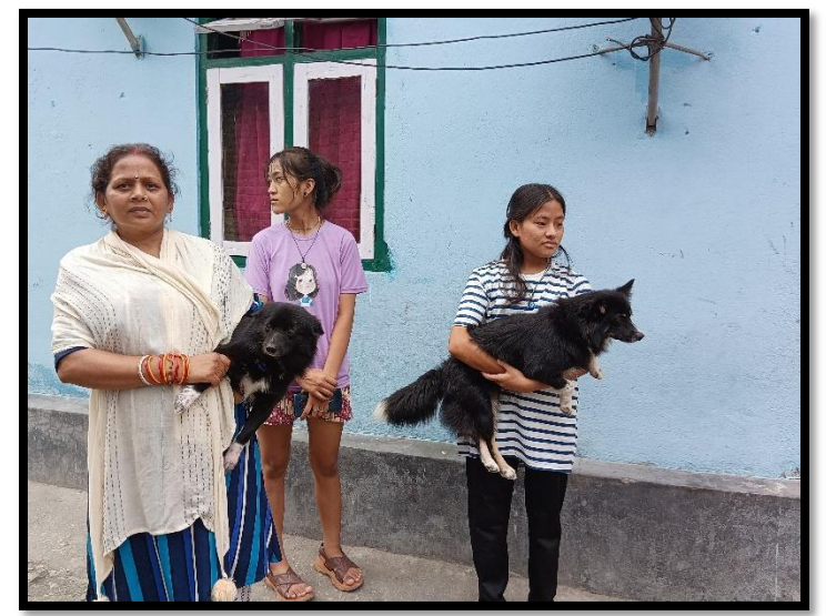
Owners' dogs come for vaccination at Rongpo