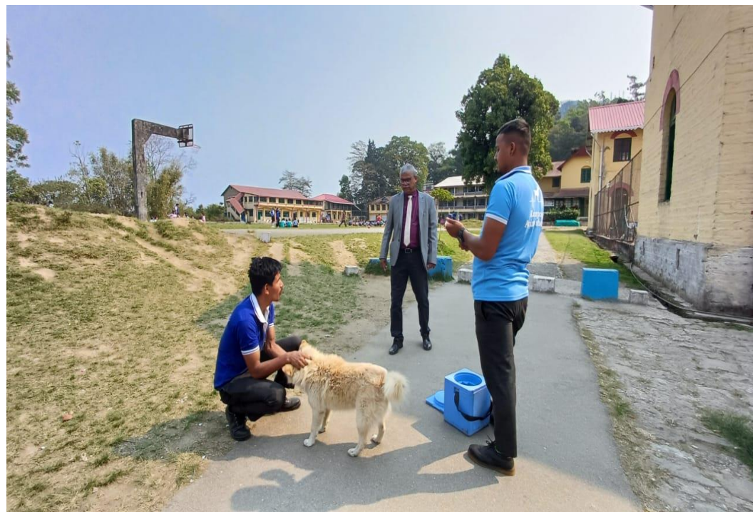
The KAS team is ready to vaccinate a community dog at Dr. Graham's Homes

Several complaints received this month were addressed effectively through immediate rescues and thorough patrolling of areas with dogs in need of assistance. For instance, a dog in Mangal Dara required rescue, and the team adjusted their efforts based on information from a hotel complainant who noticed the dog only in the evenings. This led to multiple evening patrols to ensure the successful rescue of the dog.