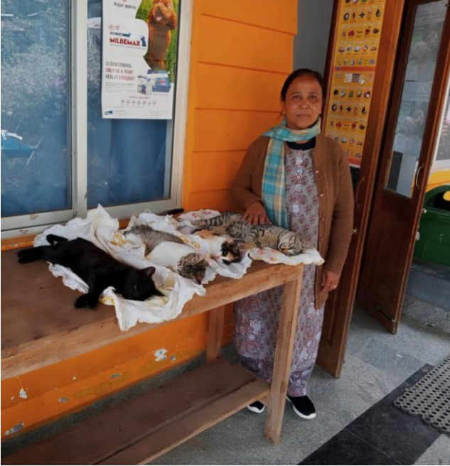
Owners attend to their Spayed Pet Animals at the Shelter