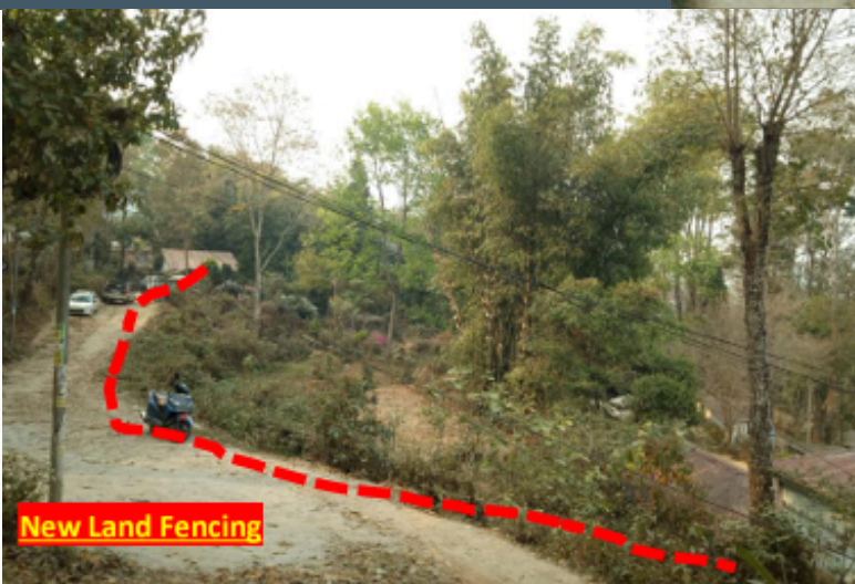
New Land Fencing