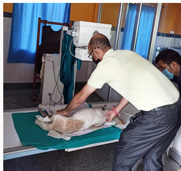
The X-ray machine at Kalimpong shelter has saved countless lives.

We welcome visitors to our Shrine Room, a tranquil space within the shelter where individuals seeking solace during animal treatment can meditate or rest. Over time, the room has aged, necessitating maintenance work.