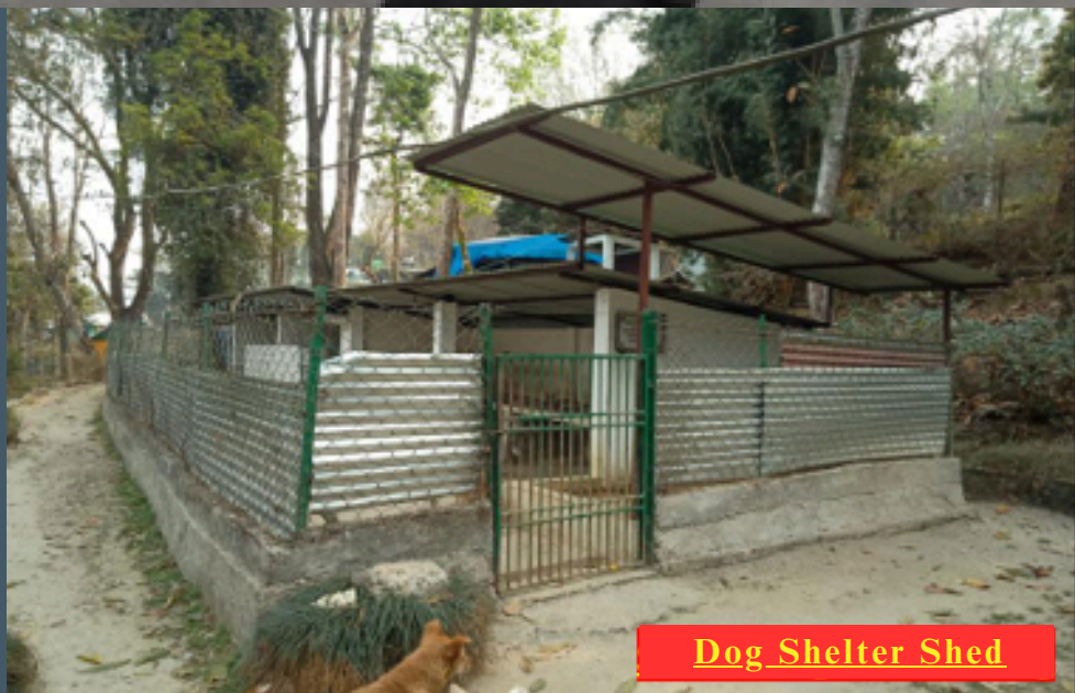
Dog Shelter Shed

Land Fencing: Fencing for land acquired for use as a dog run.