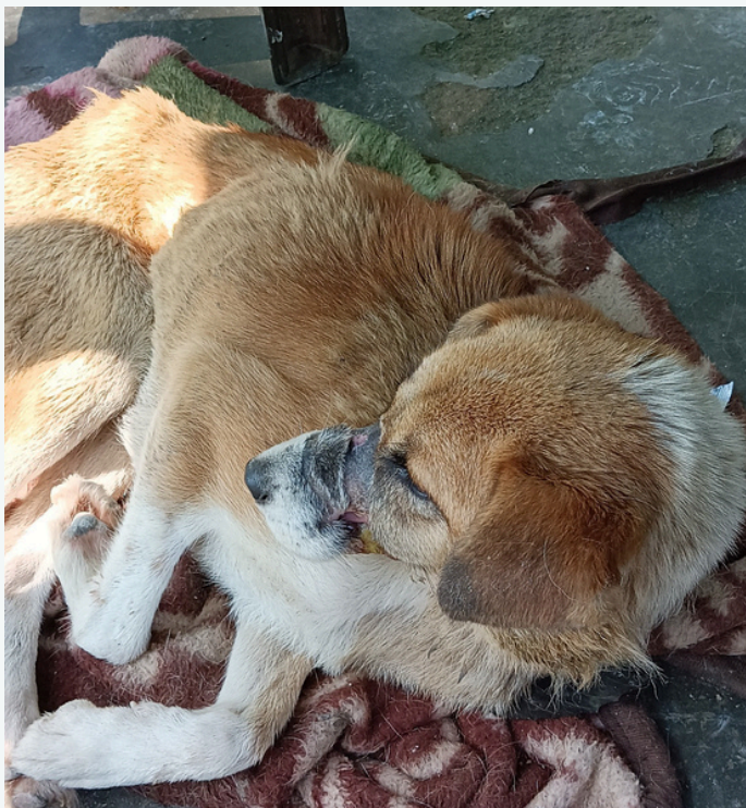
Rescue Care & Treatment

KAS carried out eight rescues in August, most involving dogs suffering from maggot infestations that had gone untreated for days. We also responded to requests from community dog caretakers to sterilize female dogs that had become a local menace. After sterilization and post-operative care, these dogs were returned to their respective communities, healthier and free from suffering.