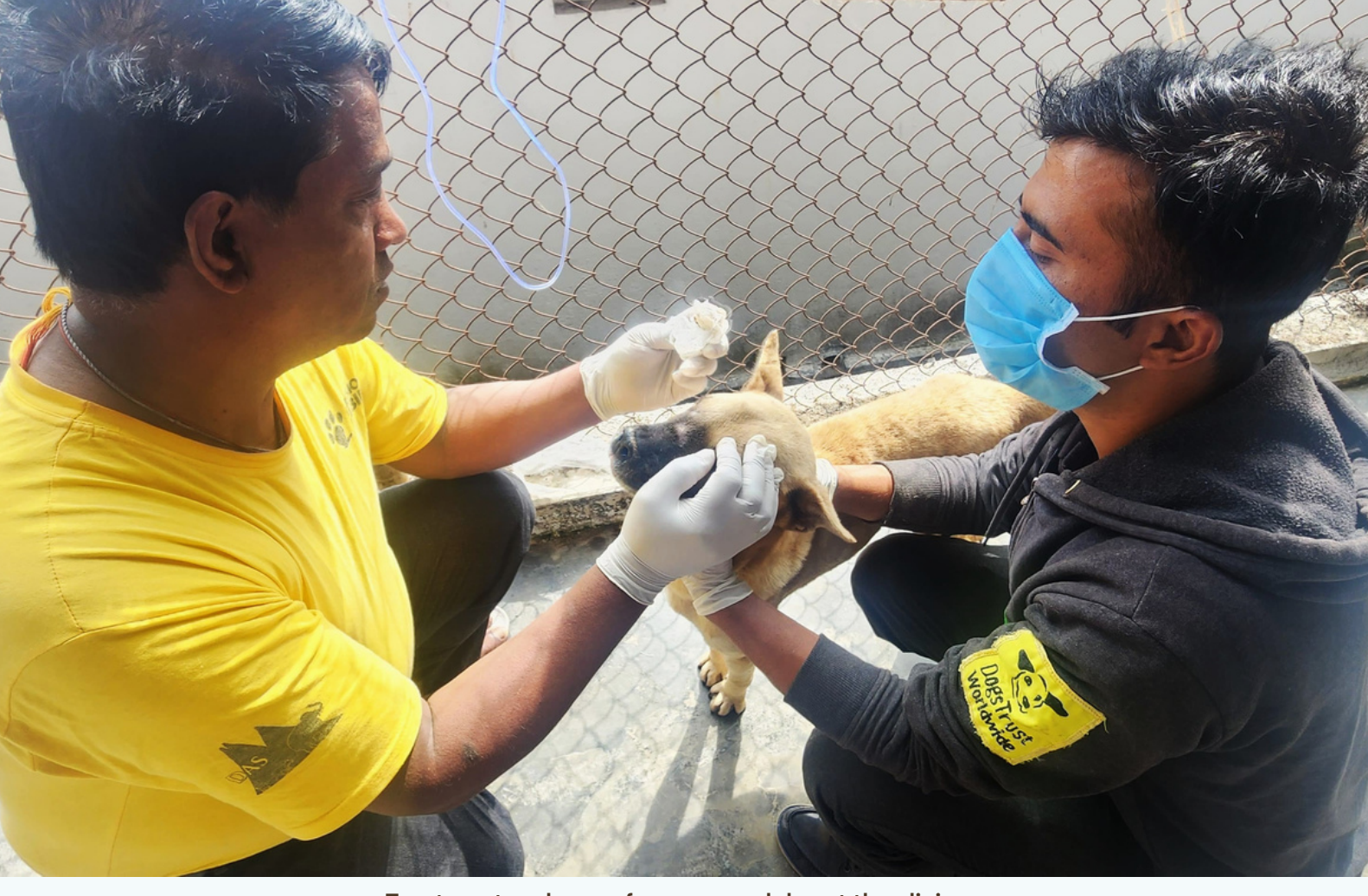
Treatment underway for a rescued dog at the clinic