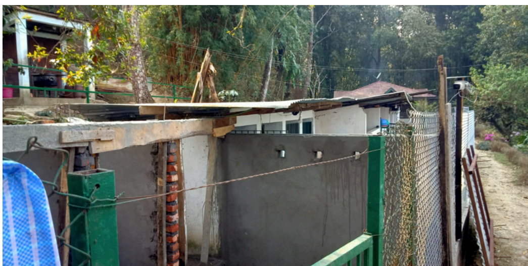
ADDITION OF NEW KENNELS