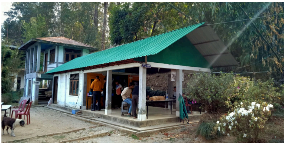
NEWLY COMPLETED CLINIC ROOF