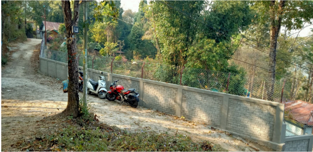
NEW LAND FENCING

Several repair and maintenance tasks have been completed, and the construction of new kennels is currently underway. The new land fencing at KAS is now finished, along with the puppy shed and handrails.