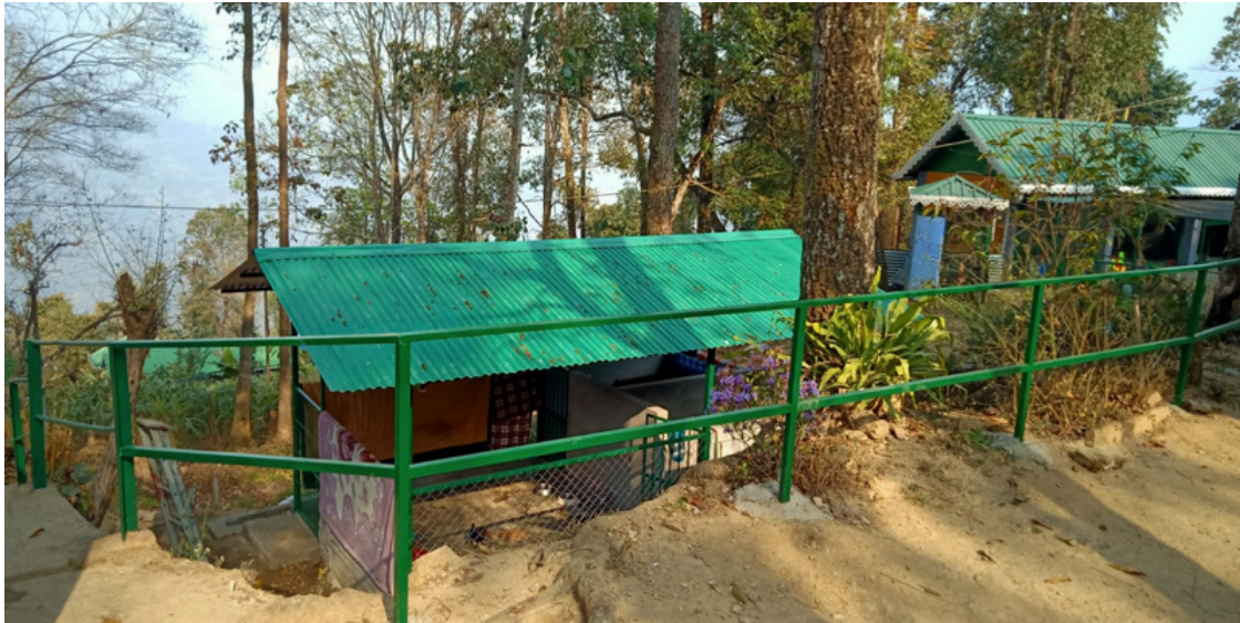
THE NEW PUPPY SHED AND THE ADDED HAND RAILS ARE COMPLETE